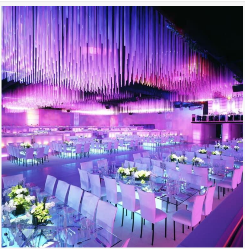
Chameleon Chairs at the 2006 Academy Awards. White Suede covers reflecting a sleek, Asian-inspired aesthetic.

With an unmatched legacy and a bold vision for the future, Chameleon Chair Collection continues to set the gold standard in luxury event seating—proving that when it comes to elegance, versatility, and iconic design, there is only one Chameleon.