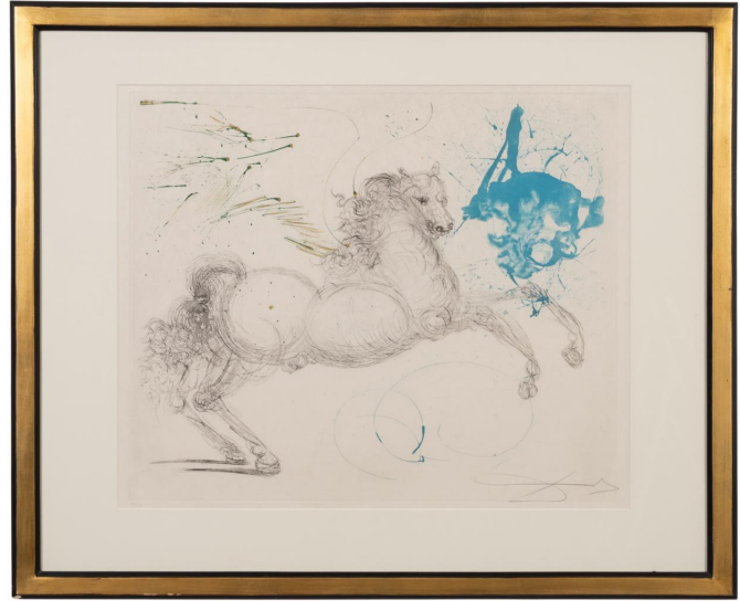
Etching and aquatint in colors on Japon paper by Surrealist master Salvador Dali (Spanish, 1904-1989), titled Pegasus, from the "Mythology" series, circa 1963, artist signed lower right ($11,495).