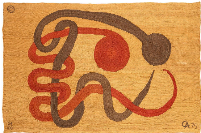
Maguey fiber tapestry (Guatemala) after Alexander Calder (American, 1898-1976), titled Lambrizi (1975), numbered "23/100" lower left and large at 56 inches tall by 84 inches wide ($16,940).