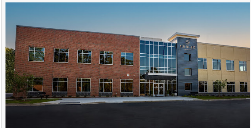
New Waters Recovery Building

such as anxiety, depression, or bipolar disorder, making it essential to conduct comprehensive psychological assessments before prescribing medication or determining a treatment approach.