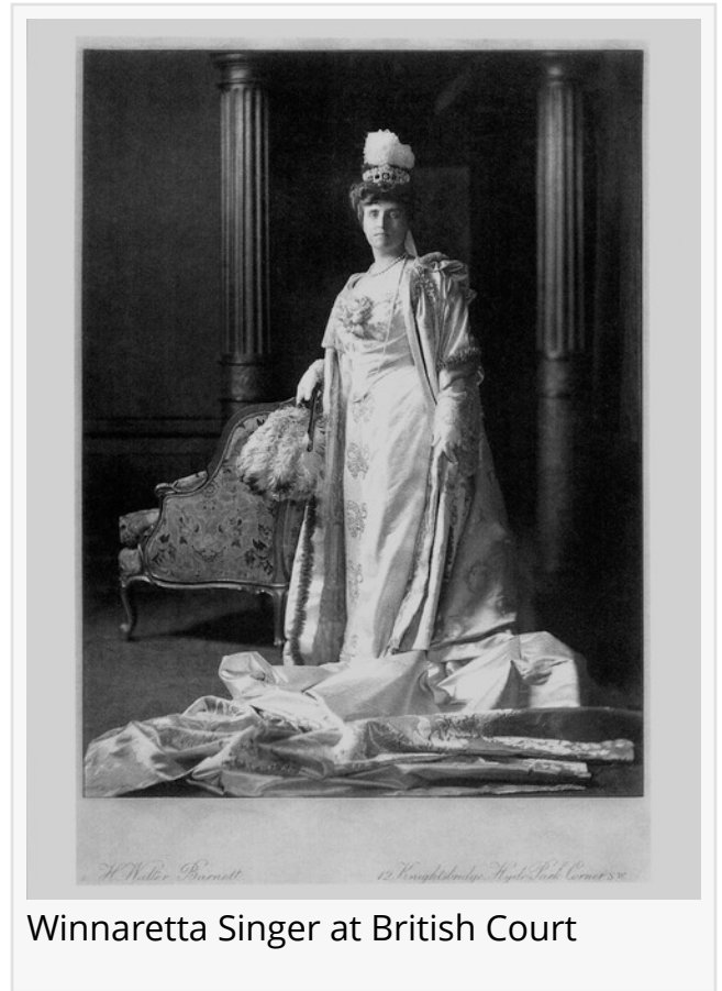
Winnaretta Singer at British Court