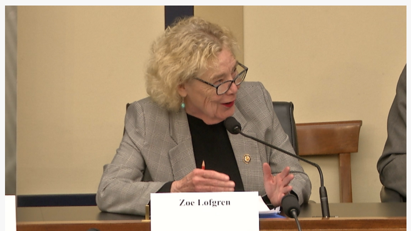
Congresswoman Zoe Lofgren speaking with Mrs. Maryam Rajavi during the 26 Feb 2025 House Hearing by the Congressional Iran Human Rights and Democracy Caucus where Mrs. Maryam Rajavi testified on the future of Iran, received bi-partisan legislative support of 150 members

Once the Constituent Assembly is formed, the provisional government will step down.