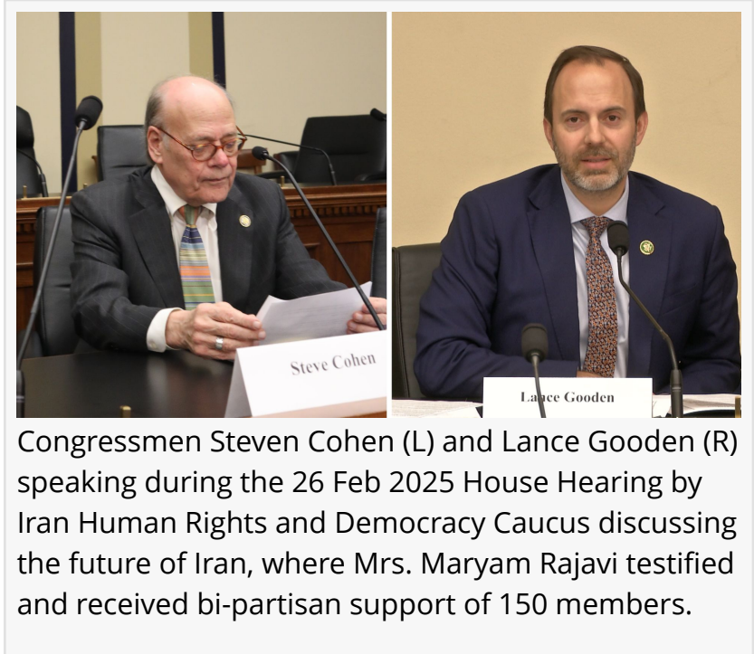
Congressmen Steven Cohen (L) and Lance Gooden (R) speaking during the 26 Feb 2025 House Hearing by Iran Human Rights and Democracy Caucus discussing the future of Iran, where Mrs. Maryam Rajavi testified and received bi-partisan support of 150 members.