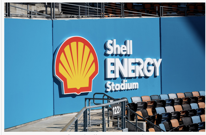
Custom Signage for Shell Energy Stadium

Uniting Innovation and Legacy ARIA Signs & Design is known for highend, trendsetting installations, leveraging advanced materials like ACM and Corten steel. Notable projects from ARIA Signs include Electric Feel Good, Ciel, Thirteen, La Pasha, Lava Lounge, Wild Concept, Bottled Blonde, Burger Bodega, Egg Haus, Dogwood Bar, the HTX sign at Minute Maid Stadium, and the Shell name change. National Signs has been a pillar of consistency and quality, trusted by corporate and institutional clients. Together, we bring decades of experience to projects that shape cityscapes—from stadiums and public art installations to architectural facades and municipal wayfinding solutions.