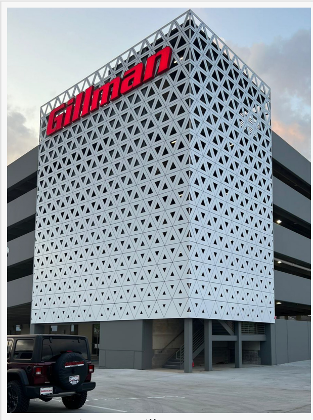
Custom Signage Gillman

Growth and Innovation in Signage Solutions For over three decades, National Signs has provided