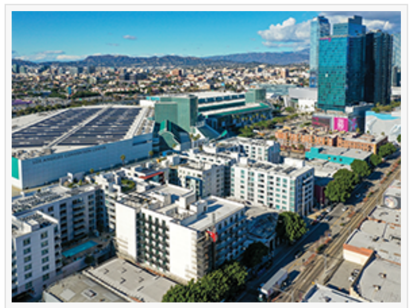
Liv DTLA, a newly opened 227-unit affordable housing development in Downtown Los Angeles, is strategically located near transit and employment hubs, demonstrating the power of Opportunity Zone investment and public-private collaboration.

Through a five-year master lease with the Los Angeles Homeless Services Authority, the building will provide permanent supportive housing with wraparound services by The People Concern. It is the county's largest master-leased housing development and will house offices for