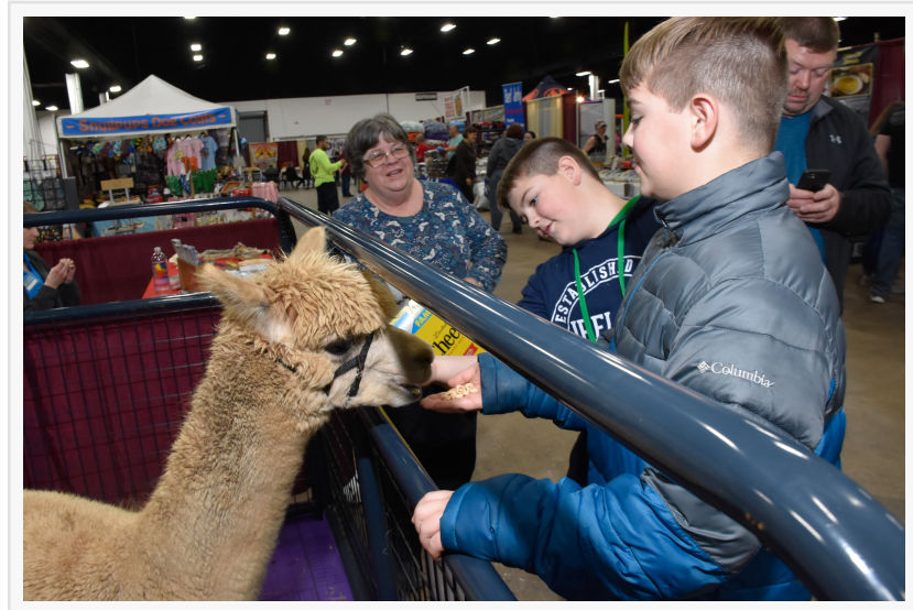
Alpacas are among the many unusual animals you can see at this year's events.

Attendees can do everything from explore (and start) the adoption process, shop for accessories, investigate better and healthier diets for the pets and learn how to train and best care for them – there are even drop-in veterinarians on site.