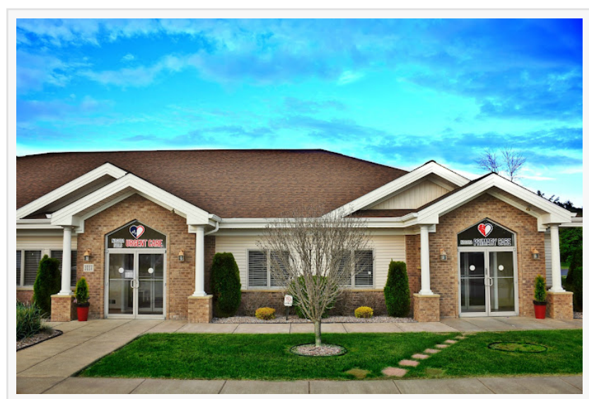
Dr. Som's Urgent Care and Primary Care

Som Medical Practice is a leading healthcare provider in the Niagara Falls region, dedicated to delivering comprehensive and compassionate care to individuals and families. With a wide range of services, including urgent care, primary care, pediatrics, chronic care management, mental health support, and addiction treatment, Sommedicalpractice.com strives to meet the diverse healthcare needs of the community.