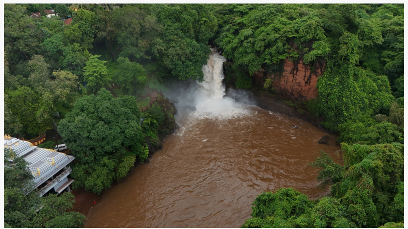
Harvalem Waterfall, Goa – A Hidden Gem Cascading Amidst Lush Greenery

As one of the premier global tourism trade events, ITB Berlin provides a crucial platform for Goa Tourism to connect with international tour operators, travel agencies, industry professionals,