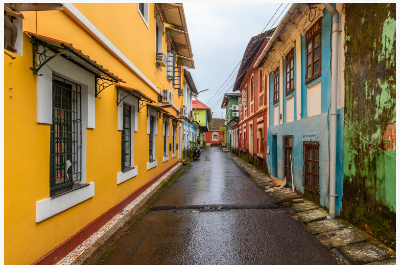
Fontainhas, Goa – A Colorful Walk Through Portuguese Heritage and Timeless Charm

"As we showcase Goa at ITB Berlin 2025, our focus remains on regenerative tourism, sustainability, and preserving Goa's cultural identity," said Shri Rohan A. Khaunte, Hon'ble Minister for Tourism, Government of Goa. "Goa is more than just a beach destination; it is a land of rich heritage, spiritual sanctuaries, and immersive experiences that offer a deeper connection with nature and local communities. Through our participation at ITB Berlin, we aim to forge meaningful partnerships and position Goa as a leading global tourism destination that prioritizes responsible and conscious travel."