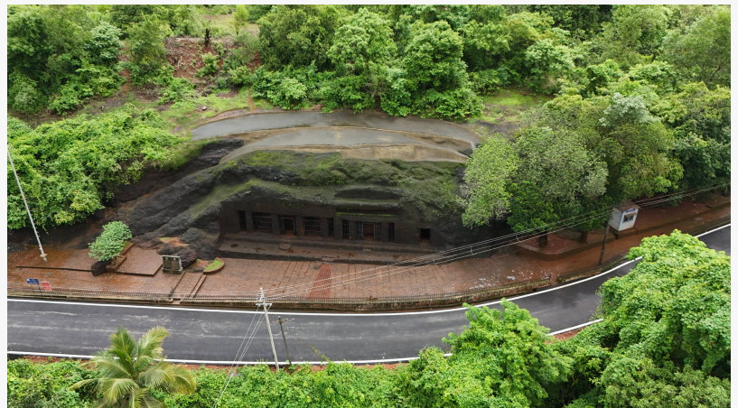
The Mysterious Pandav Caves of Goa