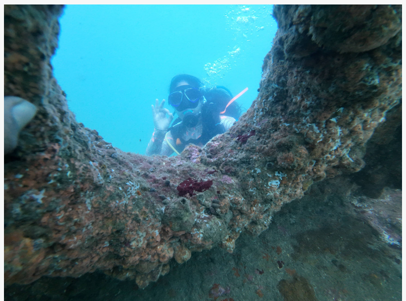
Dive into the Azure Waters of Goa – An Underwater Adventure