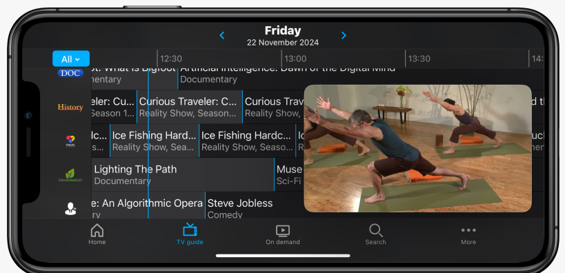
Rapido live preview within the EPG