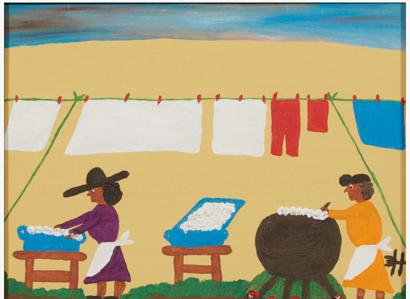
Oil on canvas board painting titled Wash Day by the renowned African American folk artist Clementine Hunter (La., 1887-1988), a fine representation of her work (est. $4,000-$8,000).