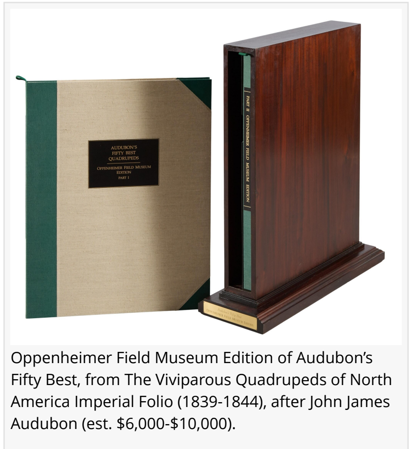
Oppenheimer Field Museum Edition of Audubon's Fifty Best, from The Viviparous Quadrupeds of North America Imperial Folio (1839-1844), after John James Audubon (est. $6,000-$10,000).