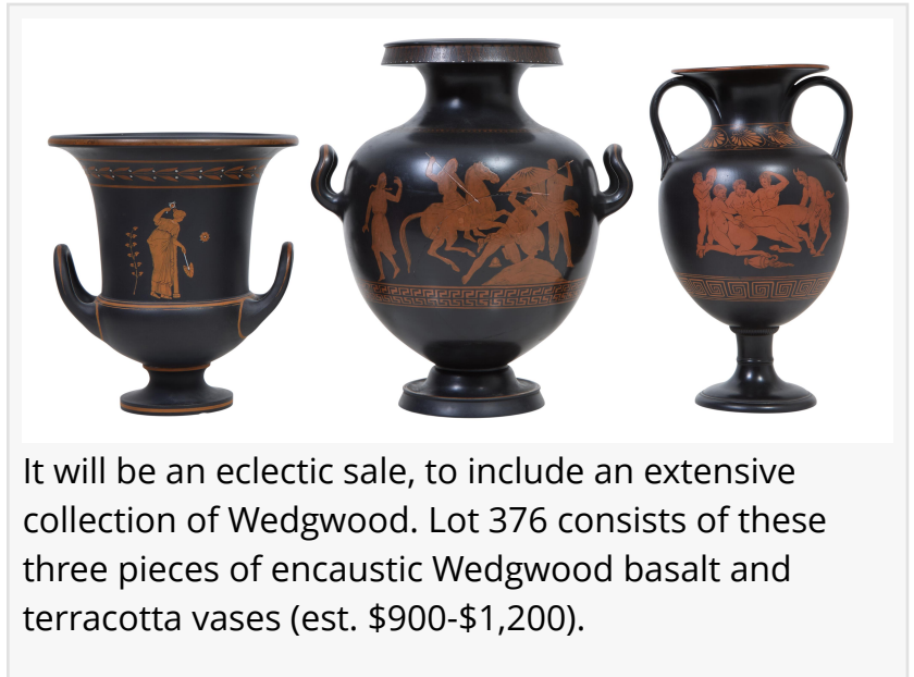
It will be an eclectic sale, to include an extensive collection of Wedgwood. Lot 376 consists of these three pieces of encaustic Wedgwood basalt and terracotta vases (est. $900-$1,200).

Adam Lambert Crescent City Auction Gallery +1 504-529-5057 email us here