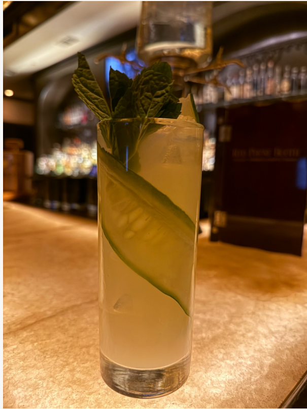
The Green Beast

Red Phone Booth’s goal is to provide each guest with the most memorable experience, always looking for opportunities to exceed each guest’s expectations while maintaining a sincere, gracious attitude. From the comfort of the seating to the training and knowledge of the staff and the quality of the air, it is all of these things and more that allow Red Phone Booth to deliver an unparalleled experience for their guests. While the exclusive lounge is open to the public, part of the unique prohibition experience is that