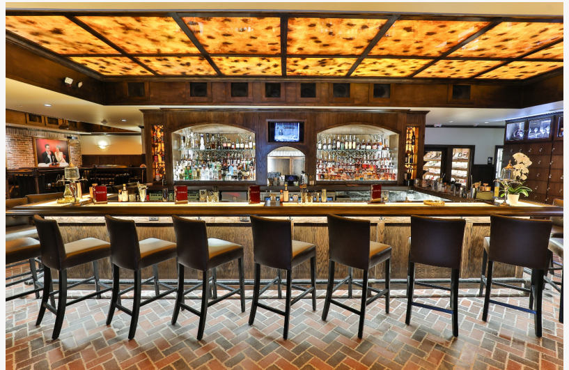
Red Phone Booth Bar