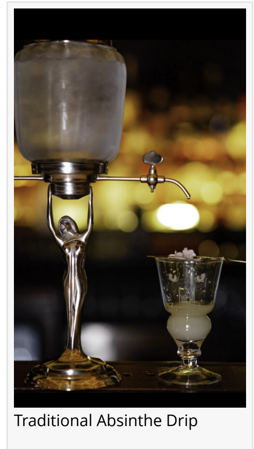
Traditional Absinthe Drip