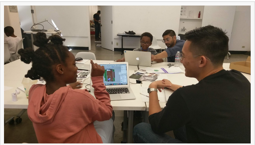
Technology, creativity, and mentorship are key components of the program

BERKELEY, CA, UNITED STATES, March 3, 2025 /EINPresswire.com/ -- (Oakland, CA) — <u>AIA East Bay</u>, a long-standing champion of mentorship and education in the architecture community, has been awarded a grant from the AIA College of Fellows to support its groundbreaking <u>New World</u> <u>Architects Summer Camp</u>. This