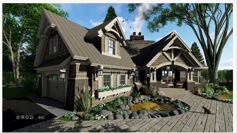
Sample Custom Home Birchwood Farms

For more information, contact: Jo Gonzalez, 231 526 2166 x 536 or info@birchwoodcc.com