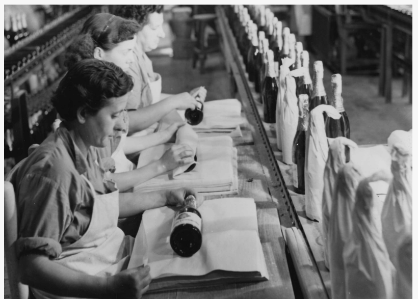
Women working at D.O. Cava

Women have long played an essential role in this industry, often taking the reins of family wineries and elevating Cava to the highest levels of excellence or preserving artisanal traditions of Jamón ConsorcioSerrano.