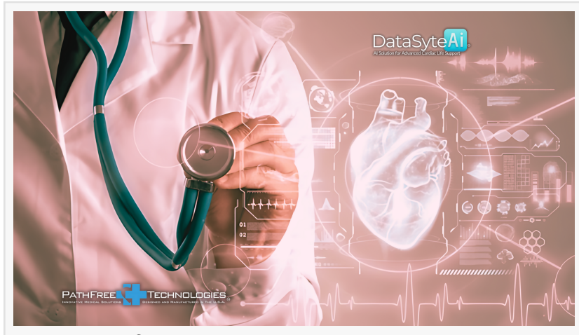
DataSyteAi for ACLS

Scalability & Adaptability: The AI model is designed for broad medical applications, including emergency medicine, general surgery, cardiology, and pediatrics.