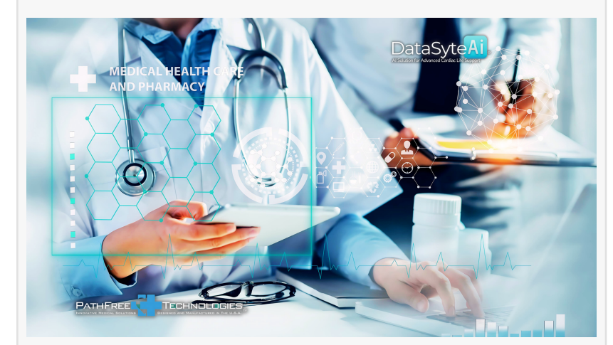
DataSyteAi Streamlines Operations