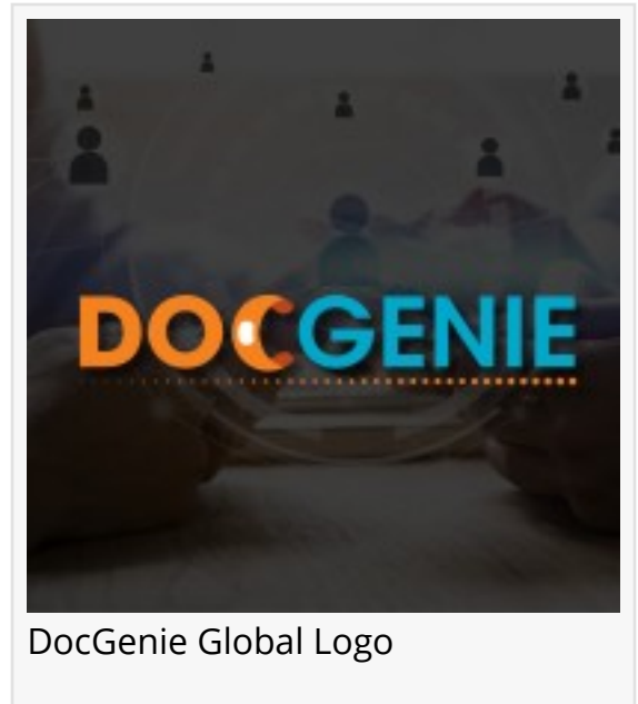
DocGenie Global Logo