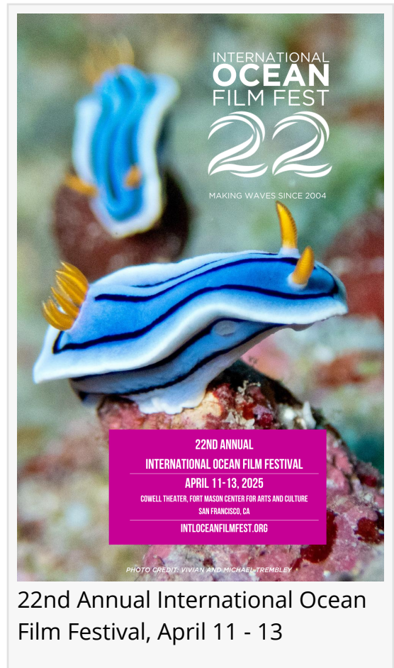
22nd Annual International Ocean Film Festival, April 11 - 13