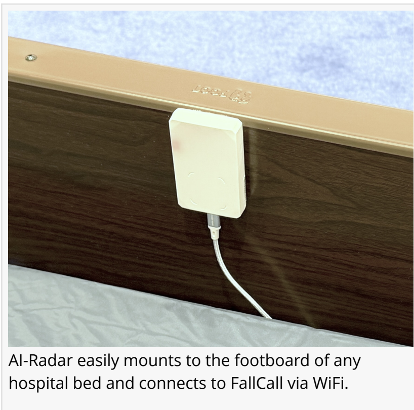
AI-Radar easily mounts to the footboard of any hospital bed and connects to FallCall via WiFi.

FallCall Solutions was established in 2015 and is a leading innovator in wearable/mobile safety solutions in the United States and Australia. FallCall's platform and partnerships aim to make remote life safety accessible, affordable, and empowering to older adults while providing caregiver peace of mind. FallCall Solutions is an AARP AgeTech Collaborative portfolio startup.