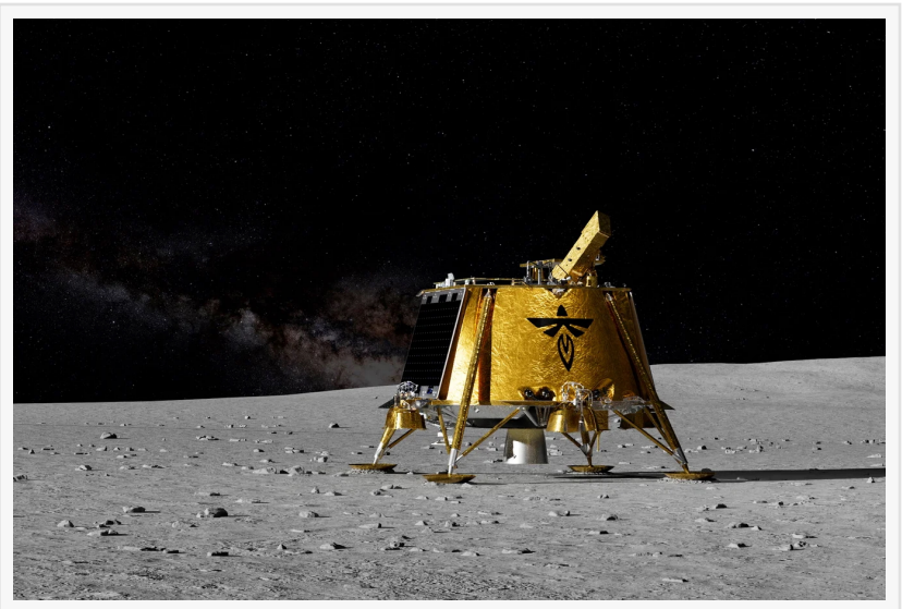
Rendered image of Blue Ghost on the Moon.

Onboard Blue Ghost are ten NASAsponsored instruments that include a lunar retroreflector for precision distance measurements of the Moon's distance from Earth, a regolith adherence characterization device to test lunar soil characteristics, a radiation-tolerant computer, and thermal exploration probes. The lander will operate for one lunar day, or 14 Earth days, until it no longer receives power from its solar panels. As lunar night approaches, scientists anticipate capturing imagery that will illuminate