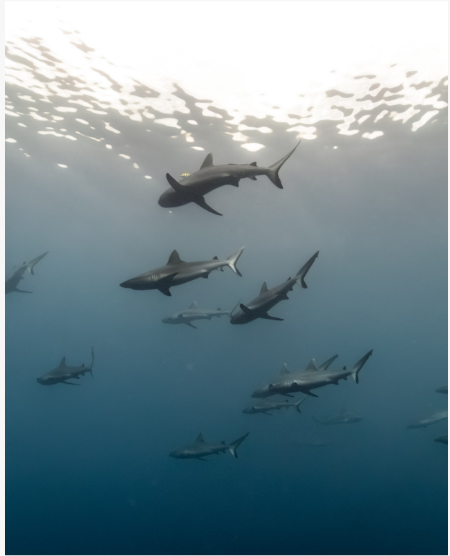
School of sharks during a dive