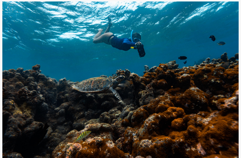
Diving at Cinnamon Hotels & Resorts Maldives