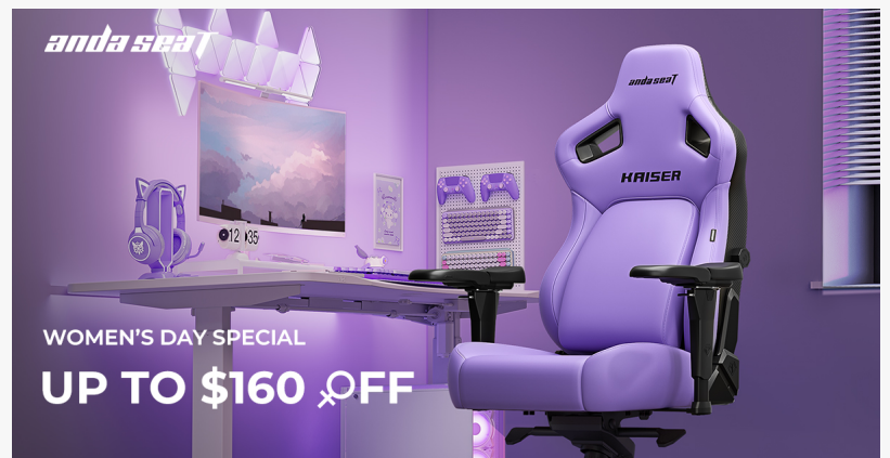
AndaSeat Women's Day Kaiser 4