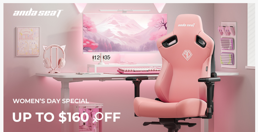
AndaSeat Women's Day Kaiser 3