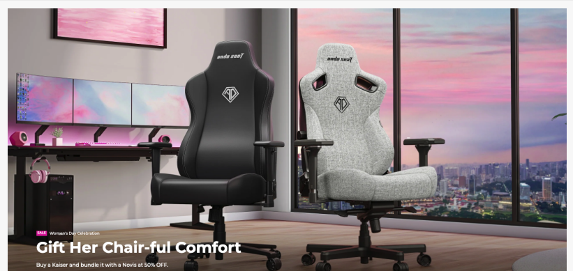
AndaSeat Women's Day 2025

The Kaiser 4 is built with long-term performance in mind, featuring a highly adaptive lumbar support system with four levels of pop-out