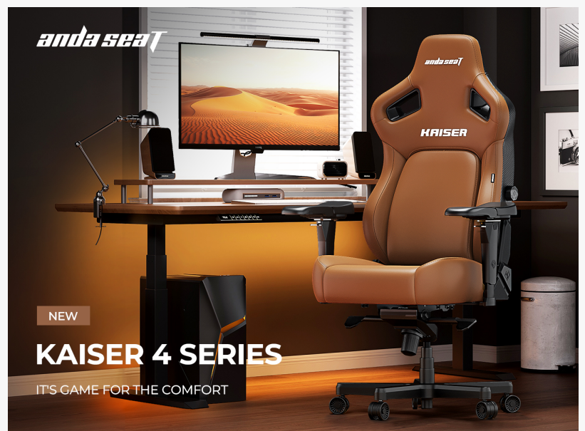
Kaiser 4 AndaSeat Brown