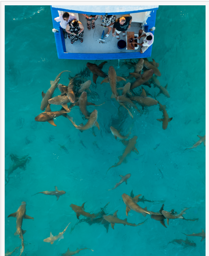
Breathtaking excursions available at Cinnamon Hotels & Resorts Maldives