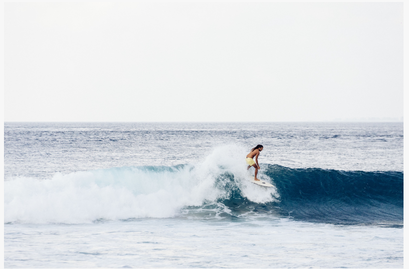
Surfing at Pasta Point

This press release can be viewed online at: https://www.einpresswire.com/article/790544443