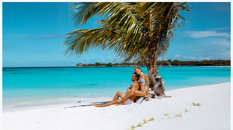
Summer at Cinnamon Hotels & Resorts in the Maldives

/EINPresswire.com/ -- Cinnamon Hotels & Resorts in the Maldives announces an exclusive limited-time offer for Cinnamon DISCOVERY members, providing a seamless and rewarding getaway experience. From complimentary transfers to a range of elevated benefits, this offer invites travellers to immerse themselves in the Maldives' natural beauty with added privileges.