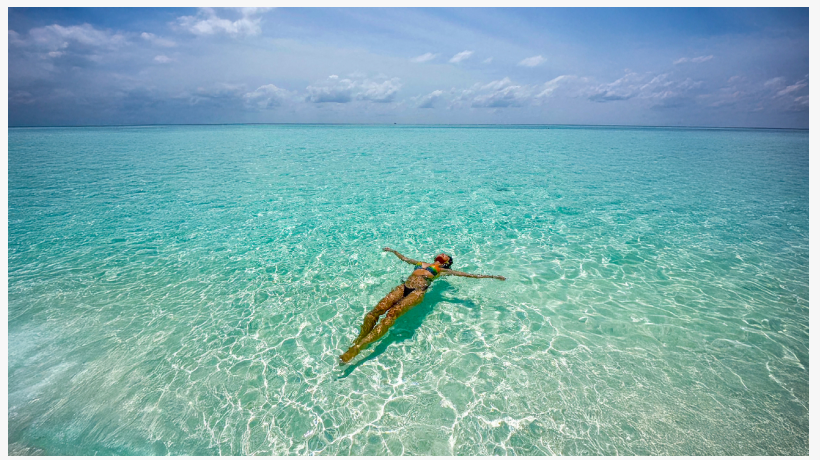
Soaking up the sun