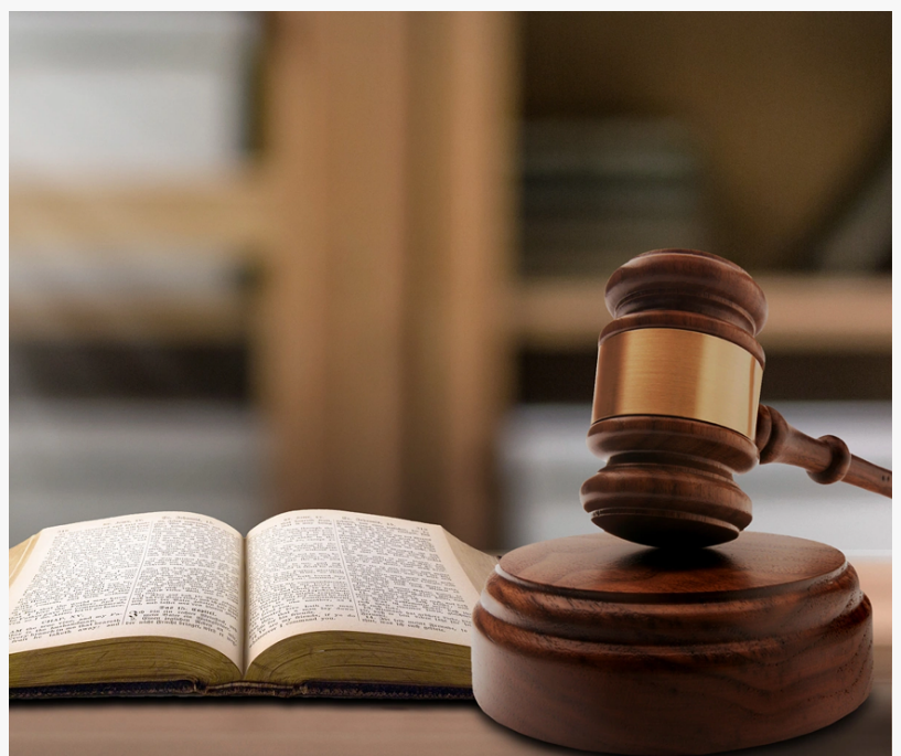
Business Immigration Law Firm.

With increasing competition and regulatory scrutiny, applicants must ensure their submissions are thorough, well-documented, and aligned with the latest requirements. This press release provides essential insights into the upcoming H1B visa application process and the revised NIW guidelines, helping professionals and employers make informed decisions.