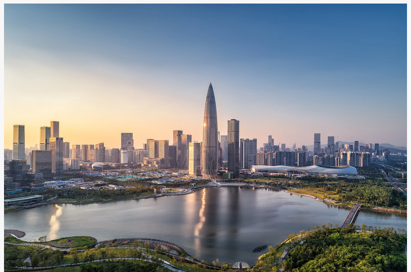
Immigration Attorney Los Angeles.