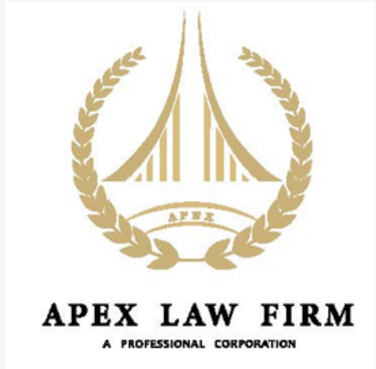
Apex Law Firm Logo.