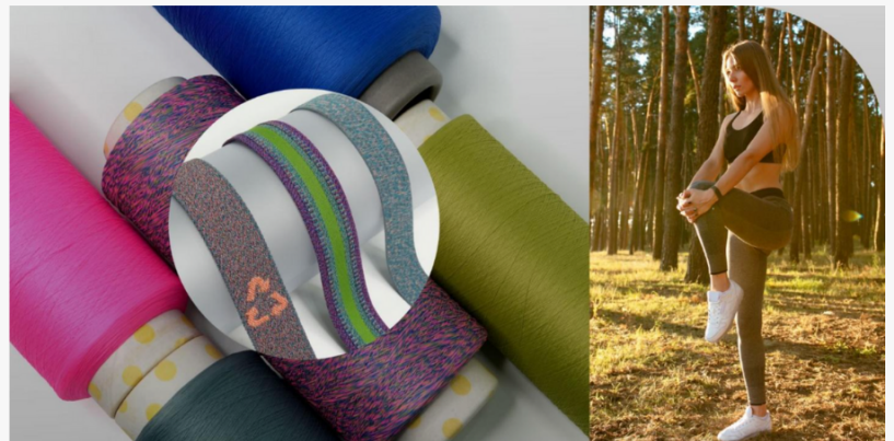
Custom ECI Elastic Tape Solutions