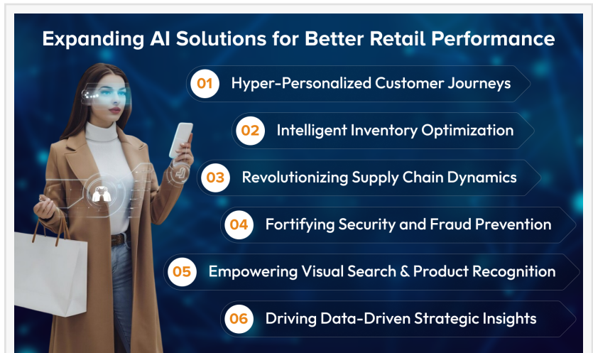
Expanding AI Solutions for Better Retail Performance

Revolutionizing Supply Chain Dynamics: Seamless Connectivity: The complexities of modern supply chains demand intelligent solutions that can seamlessly connect disparate systems and processes. Octal AI-powered logistics and tracking systems streamline operations, improve delivery times, and enhance transparency. By automating key processes, such as order