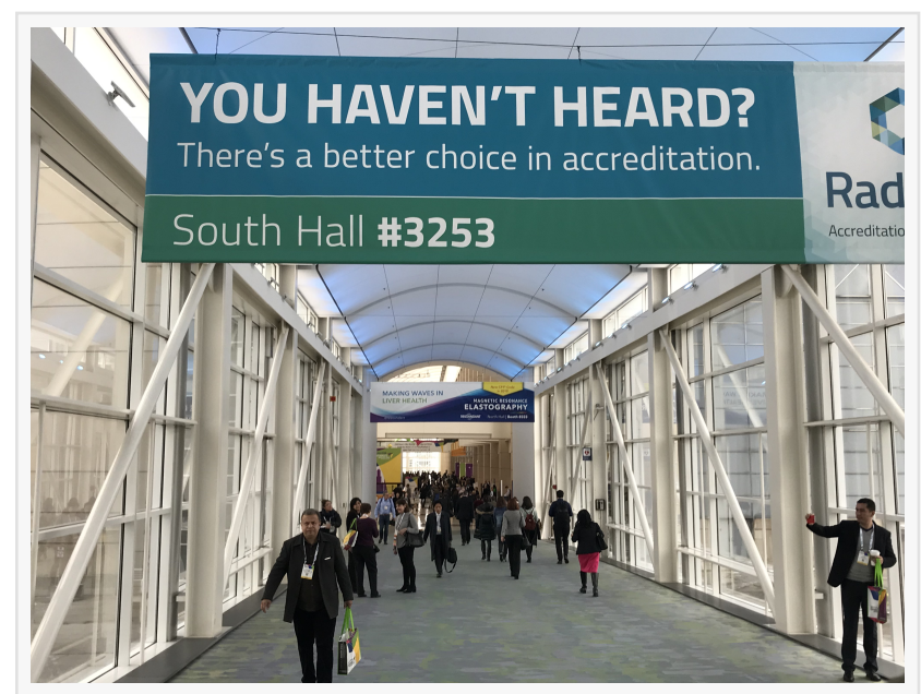
RadSite RSNA Banner

This roundtable will feature RadSite's founders and current leaders as they