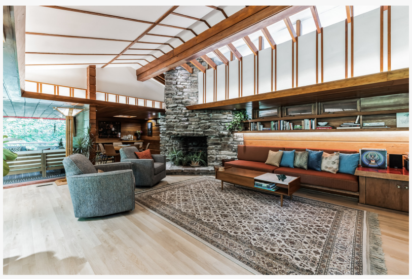
Main Living Area The Gray by Fay Jones

experience provides guests with both seclusion and accessibility. The home's striking architectural elements, combined with modern amenities and thoughtfully curated spaces, set a new standard for luxury vacation rentals in the region.