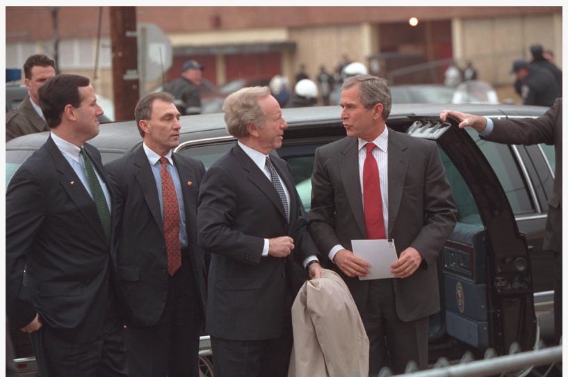
Senator Joe Lieberman and President George W. Bush exit the Presidential Limousine.

cinematic event. The documentary not only highlights the triumphs and challenges of Lieberman's career, it also serves as a heartfelt reminder of the importance of unity. Lieberman's enduring message of cooperation resonates deeply in today's polarized landscape, and the film honors his commitment to bringing people together. Watching "Centered" is more than an educational experience—it's a tribute to a leader who exemplified the strength of compassion, dialogue, and integrity.