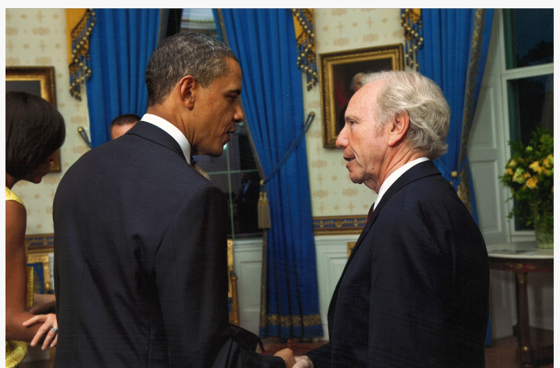
Sen. Lieberman meets with President Barack Obama. 2011.