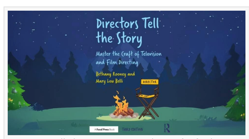
Directors Tell The Story: Master the Craft of Television & Film Directing 3rd Edition