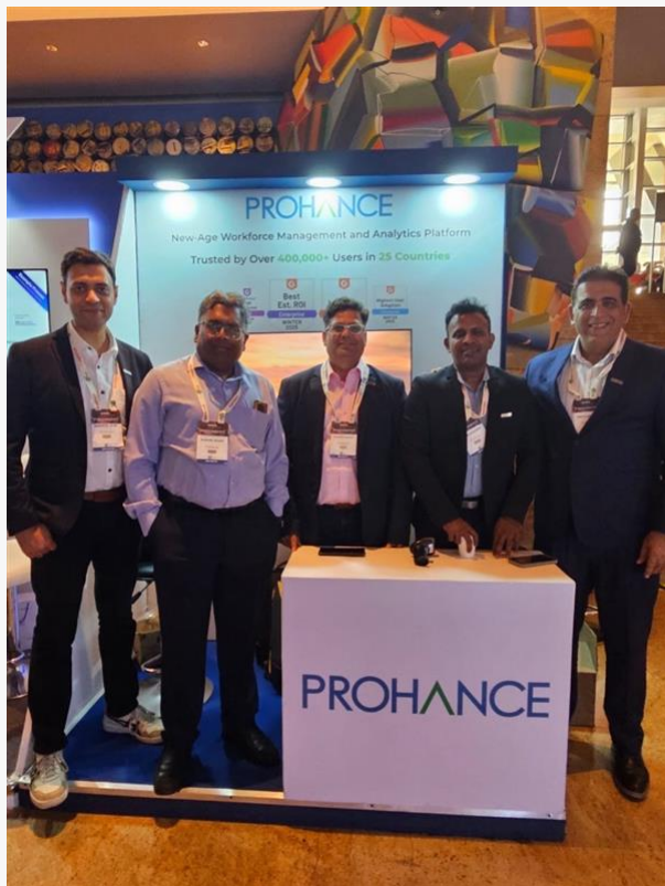
Team ProHance at nasscom NTLF 2025