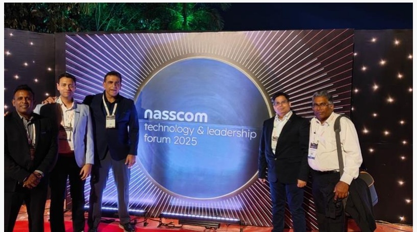
Team ProHance at nasscom NTLF 2025