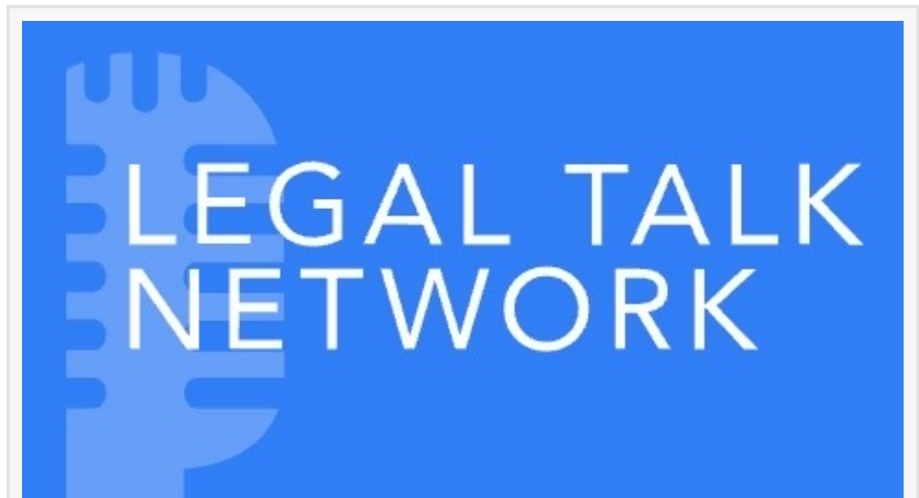
Legal Talk Network