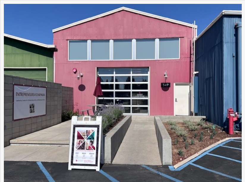
Leatherby Center for Entrepreneurship and Business Ethics Exterior

Founded in 1861, Chapman University is a nationally ranked private university in Orange, California, about 30 miles south of Los Angeles. Chapman serves nearly 10,000 undergraduate and graduate students, with a 12:1 student-to-faculty ratio. Students can choose from 123 areas of study within 11 colleges for a personalized education. Chapman is categorized by the Carnegie Classification as an R2 "high research activity" institution. Students at Chapman learn directly from distinguished world-class faculty including Nobel Prize winners, MacArthur fellows, published authors and Academy Award winners. The campus has produced a Rhodes Scholar, been named a top producer of Fulbright Scholars and hosts a chapter of Phi Beta Kappa, the