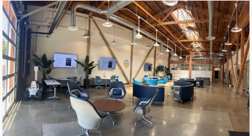
Leatherby Center for Entrepreneurship Interior 2025