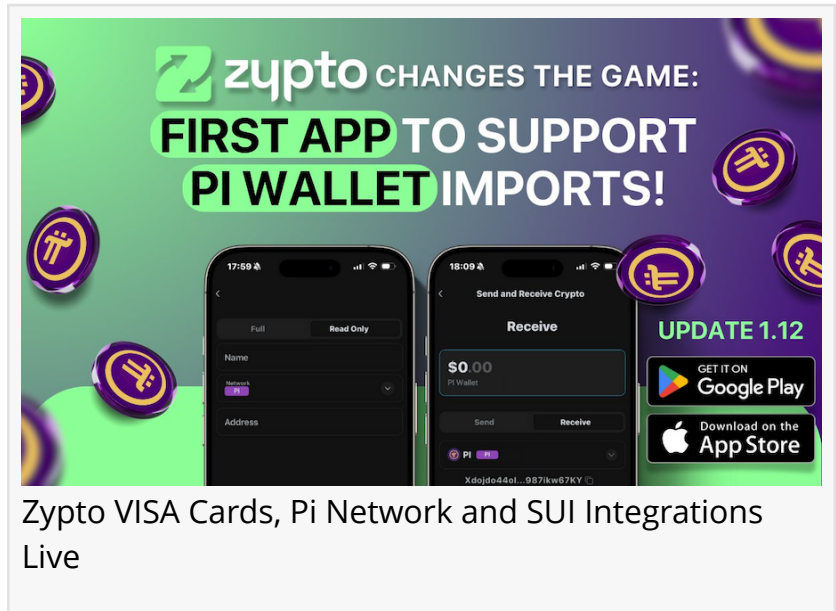
Zypto VISA Cards, Pi Network and SUI Integrations Live

/EINPresswire.com/ -- With new reloadable cards, becoming the first ever third-party crypto wallet app to integrate Pi Network, upcoming SUI integration, and more, Zypto's drive towards mainstream crypto payments adoption is showing no sign of slowing down.