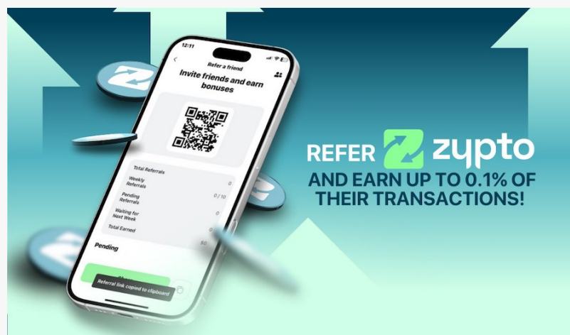
Refer friends and family to use Zypto App to earn commissions on their transactions