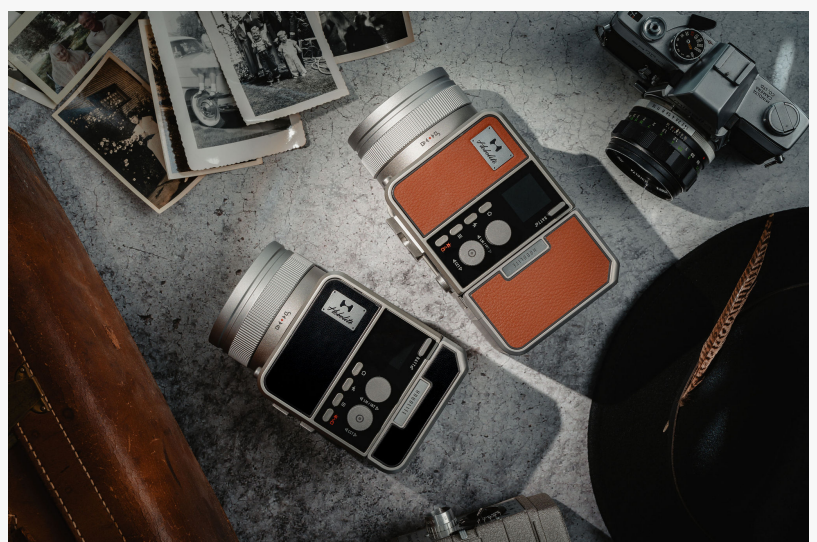
Avant Max.

to craft immersive visuals. The Avant Max 80W Bi-Color LED Light provides a powerful yet portable studio lighting option, ensuring exceptional color accuracy and flexible output for creative professionals. Meanwhile, the Iris 5W Bi-Color Pocket Light is a pocket-sized yet powerful bi-color light designed for photographers and videographers needing adaptable, high-quality illumination in compact form. The Harlowe Iris redefines creative lighting with its aperture-style ring, allowing precise control over light spread—adjusting from a tight spotlight to a soft, cinematic glow. Its prism lens adds artistic dimension by bending and scattering light for prismatic effects, while interchangeable lenses offer versatility in shaping light for any scene. Inspired by camera optics, the Iris empowers photographers and filmmakers to sculpt light as intentionally as they compose their shots, making it an essential creative tool to add depth, dimension and ambience for storytelling and visual artistry.