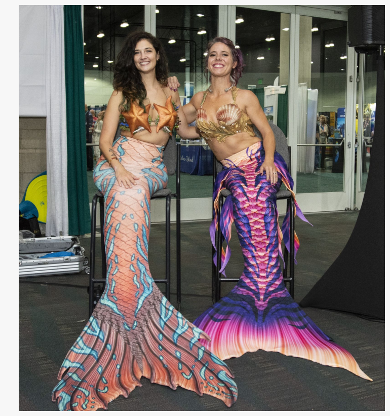
Mermaids are part of the fun at the Scuba Show

The much-anticipated Saturday night party for attendees and vendors takes place at The Cove, an underseathemed venue at the Convention Center. Starting right after the show closes, it will feature live entertainment, food trucks, a cash bar, a fundraising raffle and silent auction, and the presentation of the California Scuba Service Award.