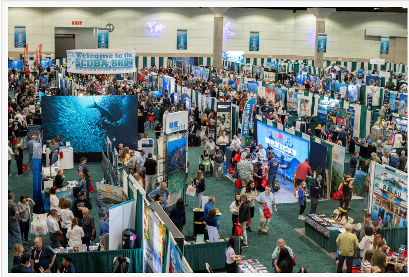
Overview of the Scuba Show floor with booths and displays

Now in its 38th year, the Scuba Show connects divers of all experience levels with the magic and adventure of