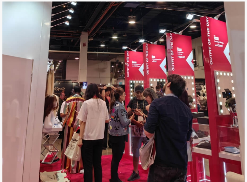
Little Heroes' Hair at IBS New York 2024

Lordhair as a brand has been propelling innovation in the hair care industry for the past two decades whilst never losing sight of its founding mission; to brighten and change the lives of each customer. The company provides high-quality hair systems and accessories that use pioneering technologies to ensure the highest level of customer satisfaction. Empathy and