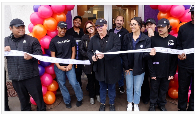
Taco Bell N Durango Ribbon Cutting

Download the Taco Bell app from the App Store or Google Play to place an order with the updated Taco Bell N Durango restaurant at <a href="https://www.tacobell.com/mobile-app">https://www.tacobell.com/mobile-app</a> or from your favorite delivery provider—DoorDash, Uber Eats, or Grubhub.