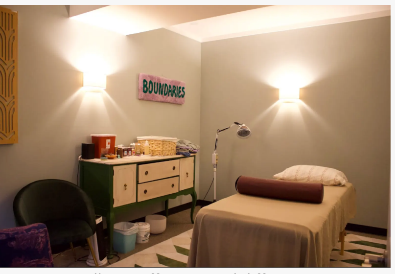
River City Wellness offers several different services at their new location.

-- SAAT Treatment for environmental and food-related allergies, including alpha-gal