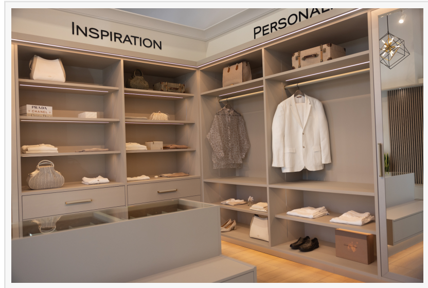
A glimpse inside PLC Closets' showroom, where custom organization meets luxury design. Thoughtfully crafted spaces blend inspiration and personalization for a beautifully organized lifestyle.

Closets have always been at the heart of the company's success. PLC Closets has worked on several high-profile projects, including Canyon Ranch, where the company got its start in closets 12 years ago. The company has since expanded its reach, with notable collaborations such as its designation as the official closet provider for Kalea Bay.