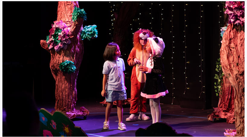
Set the Stage 2024