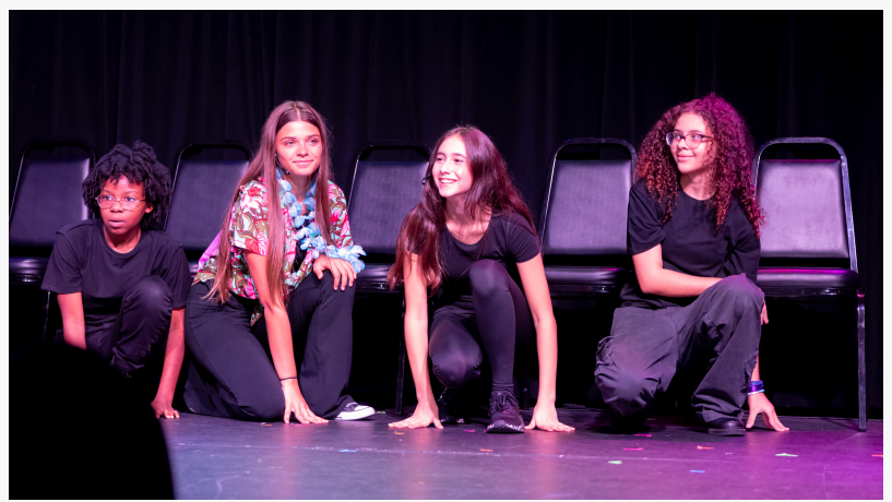
Set the Stage 2024

• Week 4 (Monday, July 28 to Friday, August 1) – Acting: Campers will learn the craft of acting for the stage while having fun playing games and building confidence. They will work together as an ensemble to rehearse a short play and present it to friends and family at the end of the week.