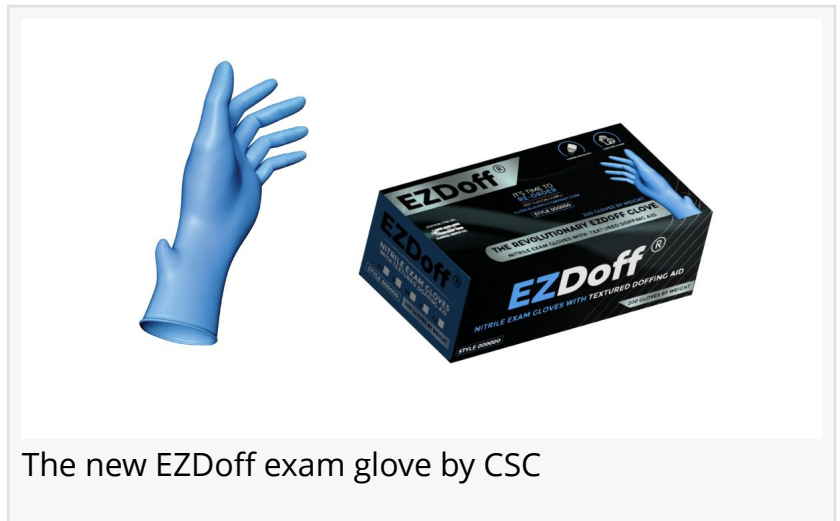
The new EZDoff exam glove by CSC

designed to support oncology professionals by reducing cross-contamination risks during glove removal. Featuring a patented removal system, EZDoff™ gloves offer a reliable solution for maintaining exceptional hygiene standards in cancer treatment settings.