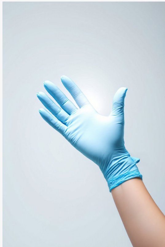
EZDoff Exam Glove with textured doffing aid