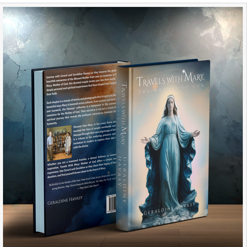
TRAVELS WITH MARY: THE MOTHER OF GOD