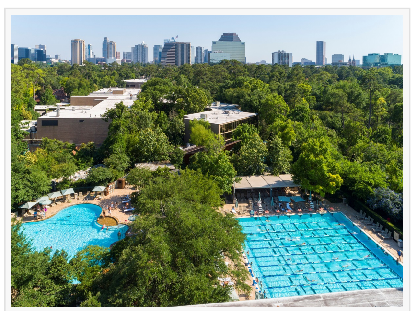
The Houstonian Hotel, Club & Spa is making Spring Break unforgettable with a Texas-sized getaway packed with adventure, from racquet sports and swim camps to basketball training and childcare services. Families can enjoy resort-style luxury, three pools, and more.

HOUSTON, TX, UNITED STATES, March 4, 2025 /EINPresswire.com/ -- The Houstonian Hotel, Club & Spa, a renowned luxury hotel in the heart of Houston, is rolling out the red carpet this Spring Break offering a Texas-sized getaway filled with recreation and adventure. Sports and immersive activities are at the top of any kid's vacation wish list, and The Houstonian delivers with top-notch offerings. From luxurious amenities and indulgent meals, to family-friendly movie nights, there are so many ways for the entire family to have fun.