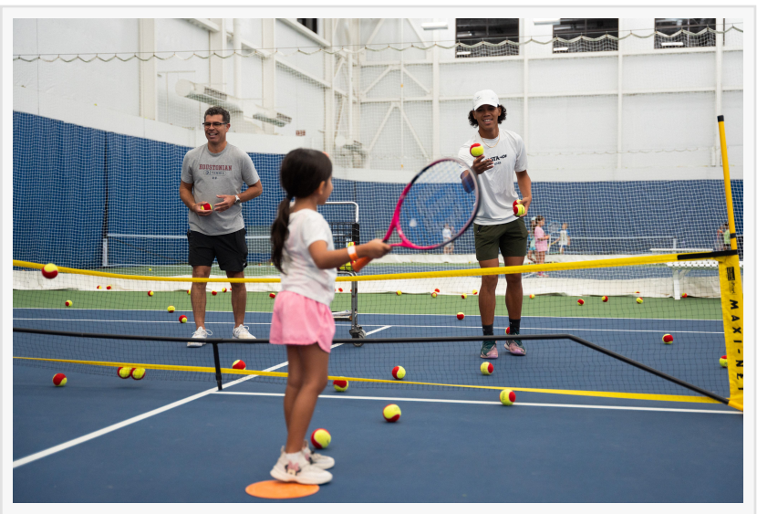
The Spring Break Racquet Sports Camps provide tennis and pickleball instruction for children ages 4 to 16, with drills tailored to individual skill levels.

In addition to the hotel grounds, families can explore Houston's top attractions with CityPASS, which provides discounted admission to must-see destinations such as Space Center Houston, the Houston Zoo, and the Museum of Fine Arts. Hotel guests can also take advantage of the shuttle, which will take them to shopping