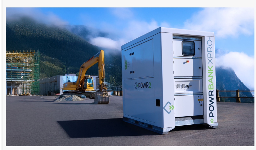
POWRBANK XPRO PLUS Battery Energy Storage System (BESS)

battery energy storage system will be on display. The soon-to-be UL-listed and CSA-certified POWRBANK XPRO Plus is designed to optimize energy use, reduce fuel consumption, and deliver