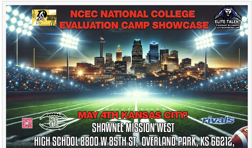
Kansas City NCEC Camp

About NCEC: The National College Evaluation Camp (NCEC) is a leading football evaluation